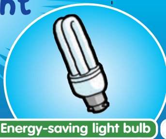
Energy-saving light bulb