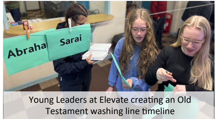
Young Leaders at Elevate creating an Old Testament washing line timeline

I was also involved in the brand-new young leaders weekend away in November. We took 13 young leaders away to a residential centre in Birmingham and had great fun helping them develop their leadership and Bible handling skills.